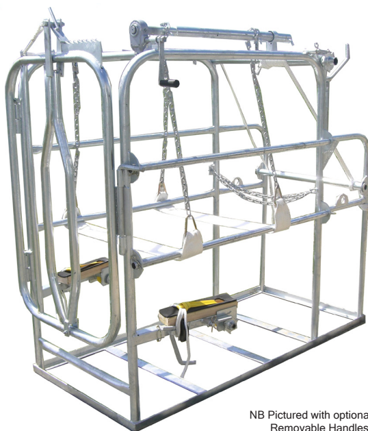
NB Pictured with optional Removable Handles.

The back hoof is then winched to a supporting bar leaving the operator with both hands free and out of the way of the knife. The front hoof is winched onto a wooden cradle and held securely with a second rope.