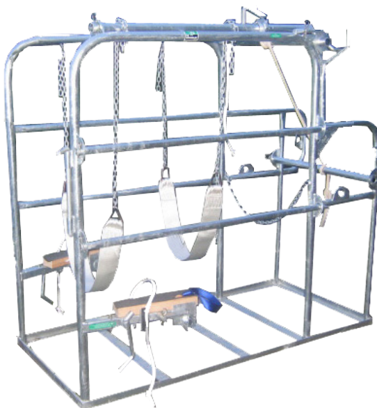
NB Pictured with optional Removable Handles.

The back hoof is then winched to a supporting bar leaving the operator with both hands free and out of the way of the knife. The front hoof is winched onto a wooden cradle and held securely with a second rope.