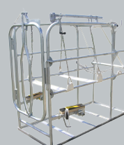
Race Wrangler also Pro Wrangler, Headbails, and Hoof Tools